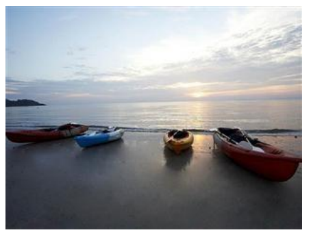
Non-motorized water sports activity