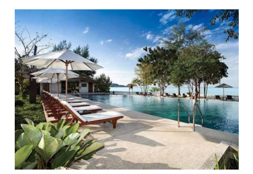
Infinity swimming pool