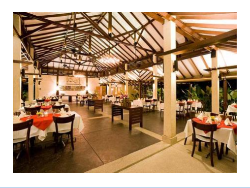
Azure, beachside restaurant for breakfast