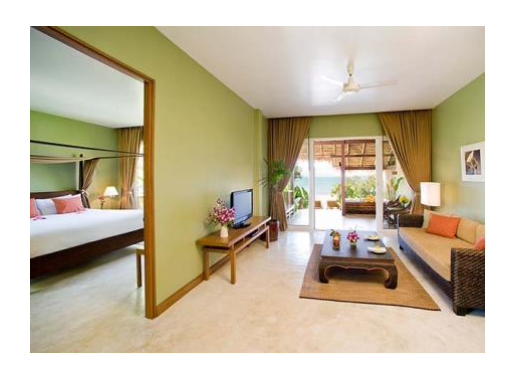
Tropical Suite Room

Centara Chaan Talay Resort & Villas Trat is backing onto a river with tropical gardens to one side and an 800-metre stretch of sugar-white sand dotted with casuarinas trees. A large infinity pool is set on the beachfront. The resort offer complimentary equipment for non-motorized water sports such as snorkeling and kayaking. Aromatherapy, therapeutic massages and skincare treatments are provided in the restful ambience of the resort spa. For participants who prefer to stay connected, wireless internet access is available throughout the resort with compliments.